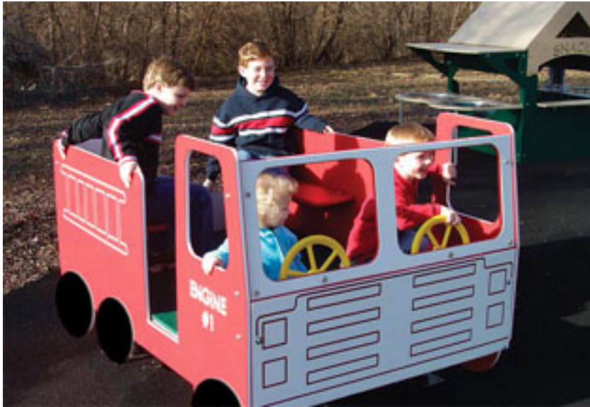
Fire Truck Multi Person Spring Rider $3,631.99 http://www.willygoat.com/outdoor/brand.asp?br=52