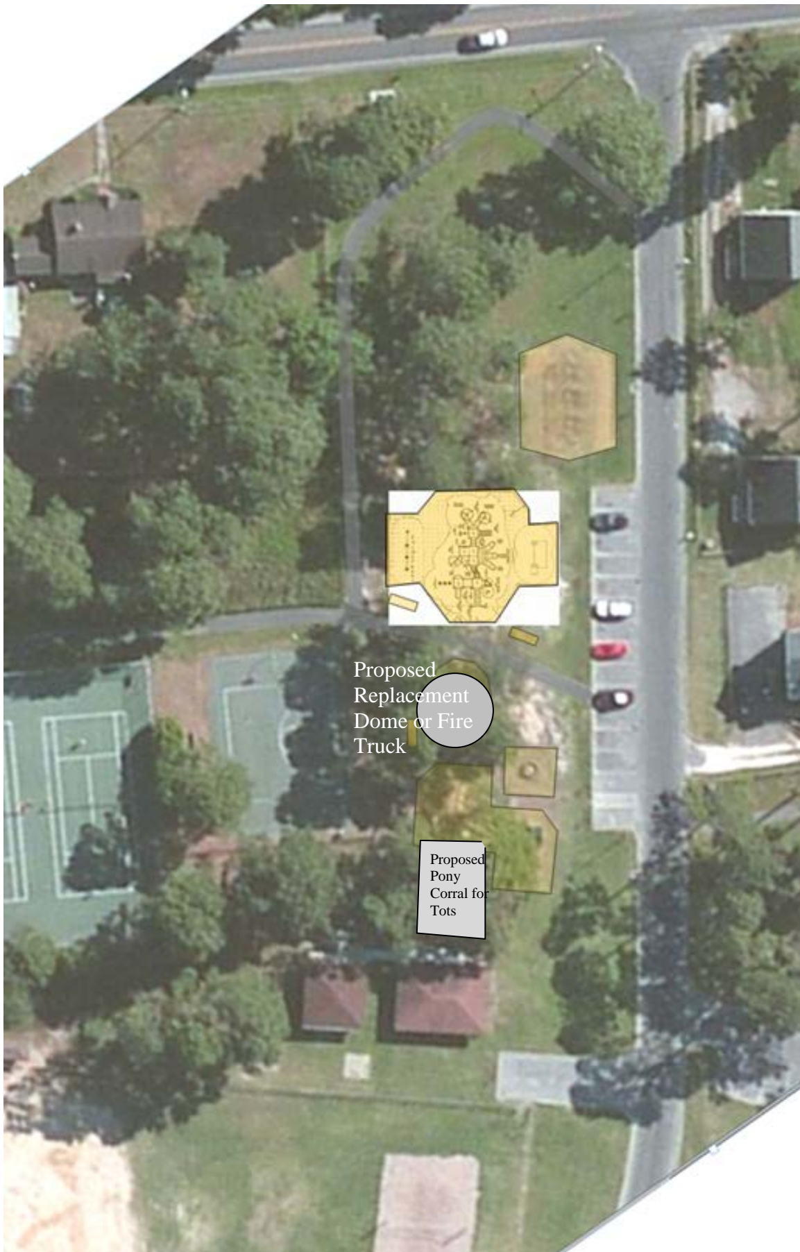
Proposed location of Phase Three Playground Equipment – August 2014