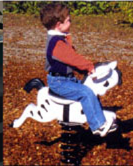
Aluminum Zebra Easy Rider $523.99 http://www.kompan.us/playground-equipment/spring-riders/Ambulance-M166